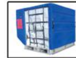
BODIES AVAILABLE IN COLORS