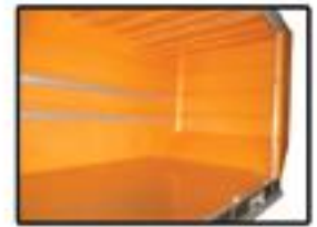
INNOVATIVE DESIGN FEATURES