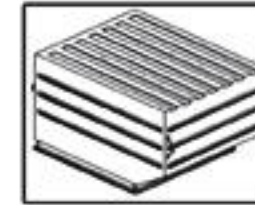
SINGLE PIECE POLYMER SHELL