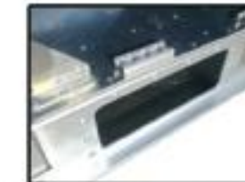
LIGHTWEIGHT ALUMINUM BASE